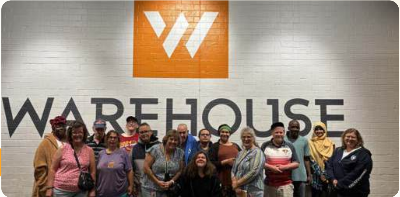
Community Living at Warehouse Cinemas for a movie night