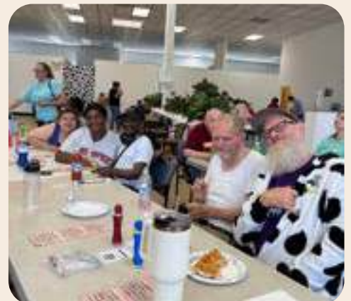
Group of people playing BINGO!