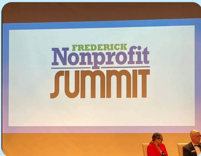
Frederick Nonprofit Summit