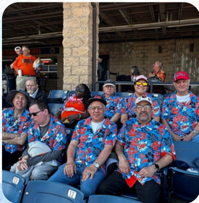
A group of people from Residential and Support Services at the Keys Hawaiian Shirt game