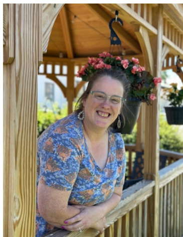
Crystal in the Gazebo

The Quality Assurance Department has been busy supporting a variety of activities and opportunities for the people we serve. From cooking classes and sporting events to Warehouse movie nights, karaoke, and bingo, there has been no shortage of fun and community involvement.