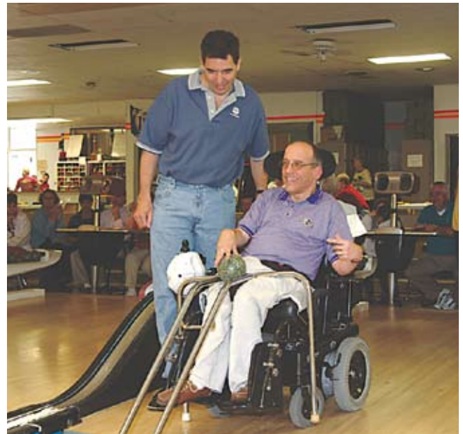
Celebration, Walk and Wag and Utica Park Community Picnic.

being involved in every step of it's operation and were at several events this past year including Baker Park's July 4th